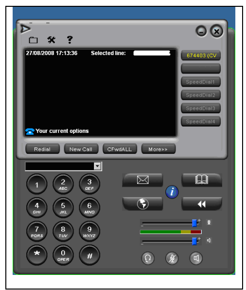
Figure 8: Phone emulator showing a successful hijacked extension

Also, if the targeted phone is already connected to the network, the race condition between the spoof device and the real phone will cause a denial of service on the targeted phone.