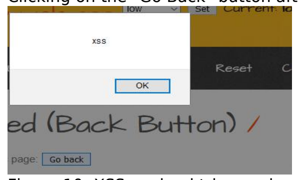
Figure 10: XSS payload triggered

Clicking on the "Go Back" button afterwards triggers the XSS payload