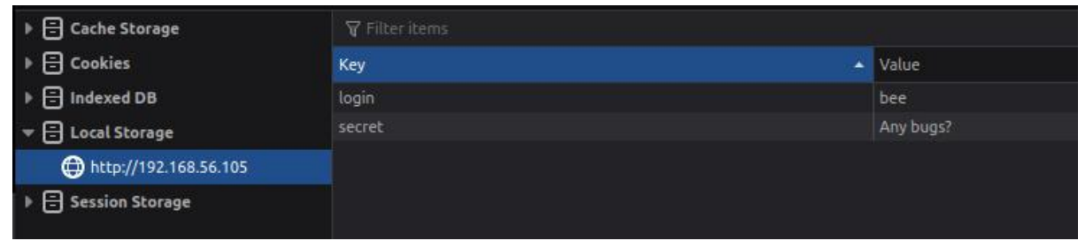
Figure 12: Values being stored in the browsers localStorage

The "localStorage" object stores data with no expiration date. | localStorage.login = "<?php echo $ SESSION["login"]?>";