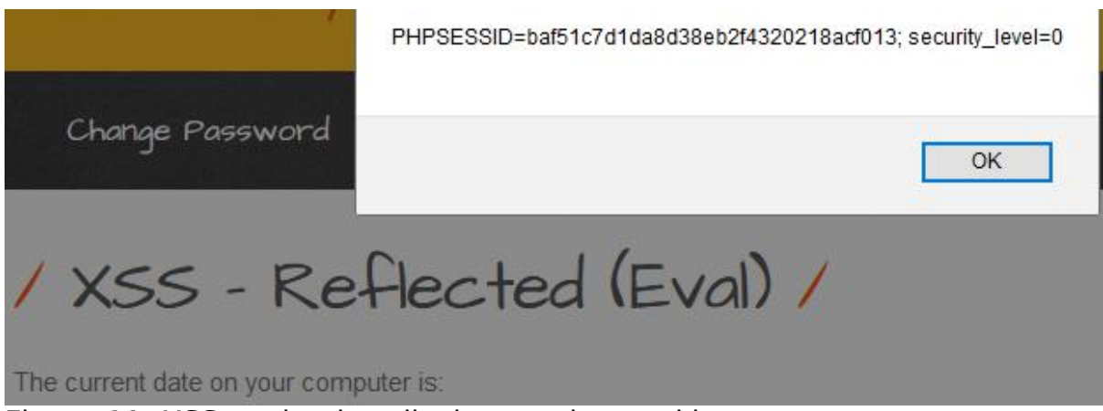
Figure 11: XSS payload to display session cookies