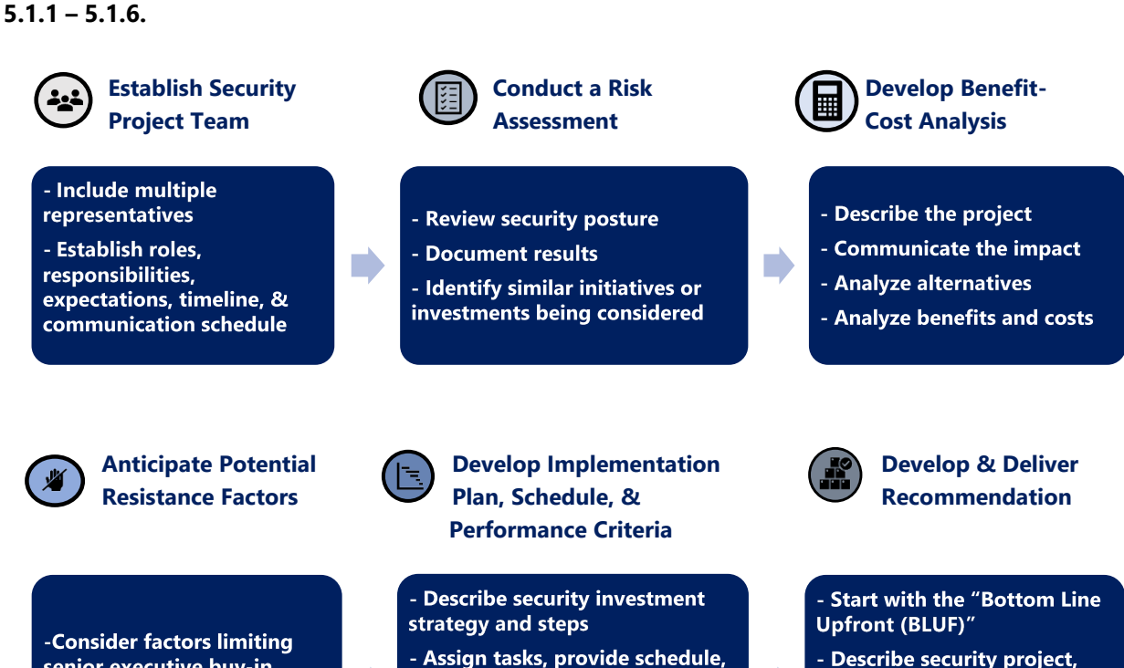
Figure 1: Elements for Creating a Business Case for Security At-a-Glance

Security professionals can tailor their business case to present a specific security investment or to propose a broader initiative, such as converged or integrated cybersecurity and physical security functions. Regardless of the security investment, the process and business case components remain the same and should contain the general elements found in Figure 1. Each element is further described in sections