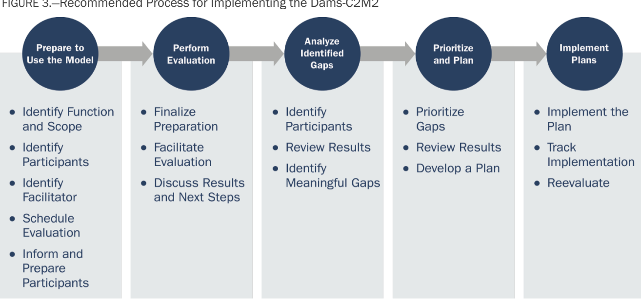
FIGURE 3.–Recommended Process for Implementing the Dams-C2M2

The Dams-C2M2 is meant to be used by an organization to evaluate its cybersecurity capabilities consistently, to communicate its capability levels in meaningful terms, and to inform the prioritization of its cybersecurity investments. Figure 3 summarizes the recommended approach for using the model. An organization performs an evaluation against the model, uses that evaluation to identify gaps in capability, prioritizes those gaps and develops plans to address them, and finally implements plans to address the gaps. As plans are implemented, business objectives change, and the risk environment evolves, the process is repeated. The following sections discuss the preparation activities required to begin using the model in an organization and provide additional details on the activities in each step of this approach. The Dams Sector C2M2 Implementation Guide provides additional details, suggested approaches, and templates to complete each of these steps.