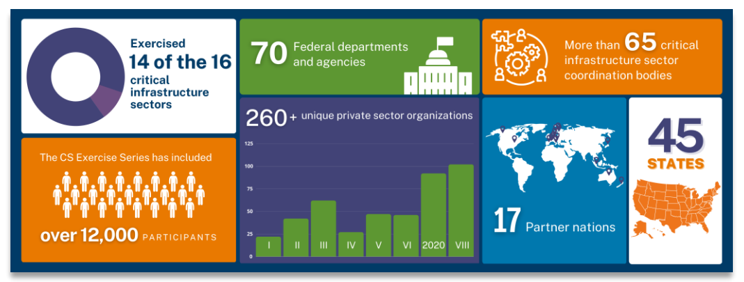
Figure 5: Cyber Storm Exercise Series Historical Data

For more information on the Cyber Storm exercise series, please visit <u>CISA.gov/cyber-storm-securing-cyber-space</u> or contact <u>cyberstorm@cisa.dhs.gov.</u>