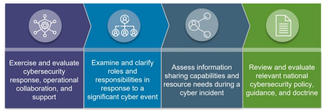
Figure 3: Cyber Storm IX Objectives

Cyber Storm IX's primary goal is to strengthen cybersecurity preparedness and response capabilities by exercising policies, processes, and procedures for identifying and responding to a multi-sector significant cyber incident impacting critical infrastructure.