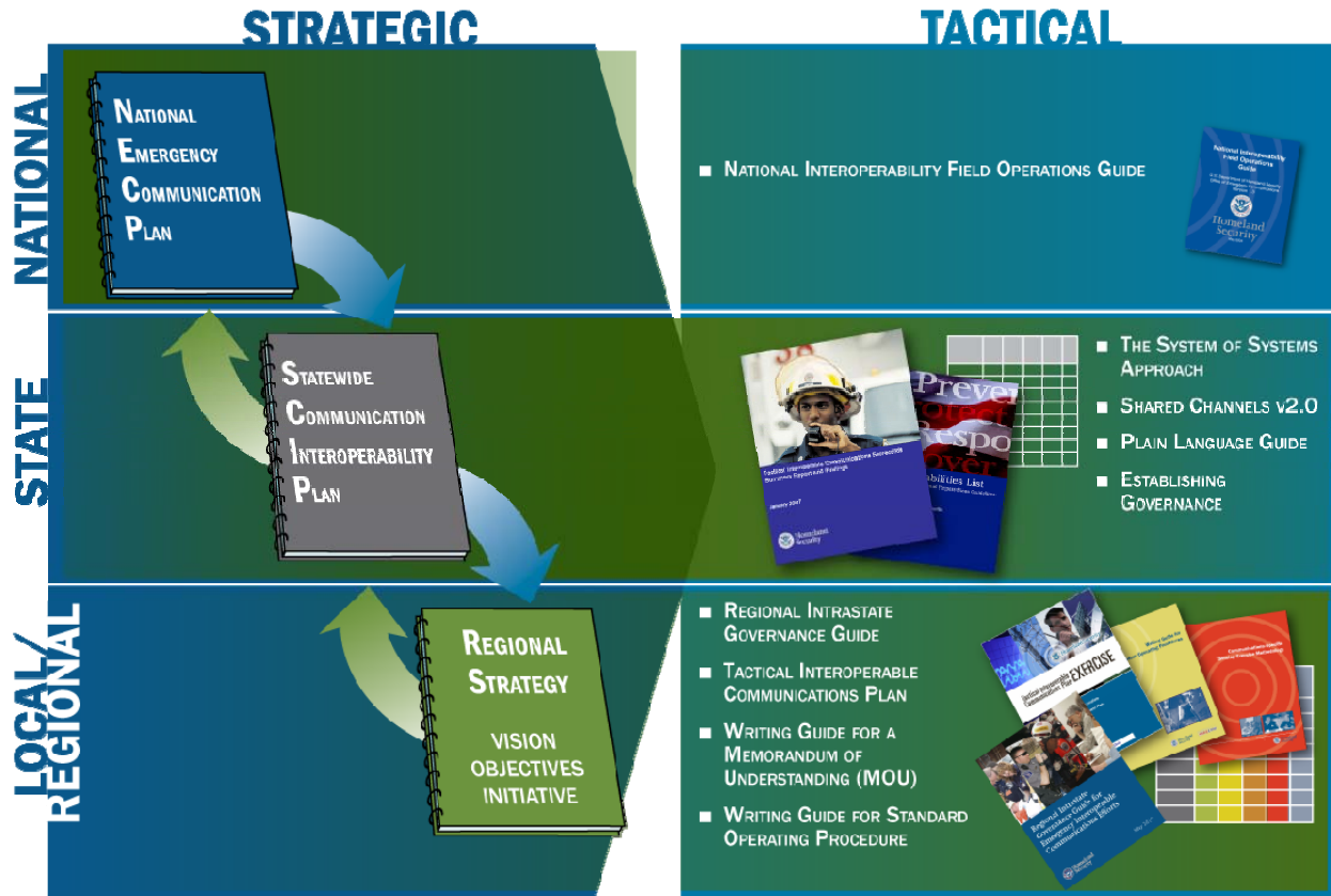
Figure 1: Strategic to Tactical

Figure 1 illustrates the importance of working across all levels of government and how experience has shown that with interoperable communications planning, national-level policy helps to shape and support strategic planning efforts at the State level, and draws on tactical planning and procedures developed at the State, regional, and local levels.