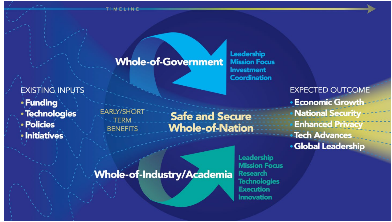
Figure 1: Conceptual model of whole-of-nation focus towards defined Cybersecurity Moonshot Initiative objectives.

and strategic vision can help focus—not limit or stifle—targeted innovation towards defined areas that can lead to a more fundamentally safe and secure Internet. Conceptually, this includes top-down pressure from the highest levels of the U.S. Government to define strategic intent, and upward pressure from the operational engines of the private sector and academia that are actively defining innovation priorities and leading progress.